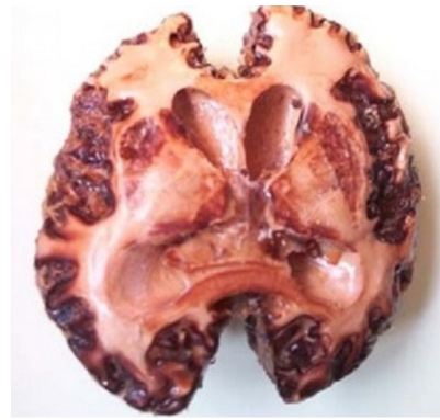
Figure 1. Brain slice produce by silicon impregnation. 19