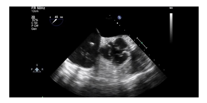
Figure 3. Post-operative transesophageal echocardiographic image through short axis of aortic valve showing the result of repair. There was no aortic insufficiency.

va. Surgical repair of the aneurysm still remains the standard treatment.