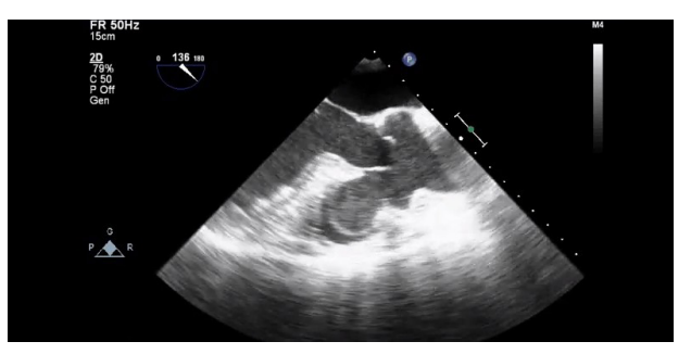
Figure 2. Two-dimentinal transesophageal echocardiographic midesophageal long-axis view showing the aneurysm of right valsalva sinus

Echocardiography and magnetic resonance imaging are useful tools for diagnosis, conservative management and intra-operative guidance. Presence of a continuous murmur along with sudden onset of chest pain and shortness of breath might be secondary to a ruptured sinus of Valsal-