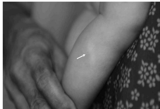
Figure 1. Lower limb of the child showing ash leaf hypopigmented macules

Since the child had no features of valvular obstruction, arrhythmias or CHF, the parents were advised to follow up regularly. Echocardiogram performed after 4 months showed that there was a significant regression in the size of the tumor.