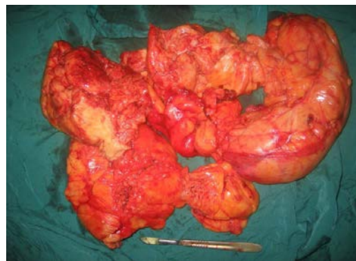
Figure 4. A huge mass after complete resection was presented.